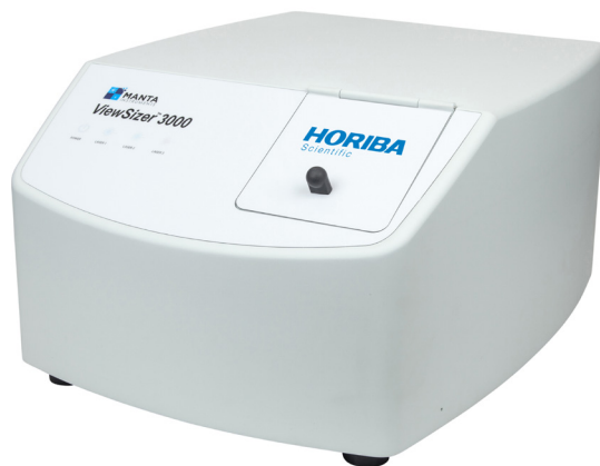
Figure 1: Image of the ViewSizer® 3000

The ViewSizer 3000 features three simultaneously operating lasers with independently adjustable power and a color camera. In this way, the data from each laser is collected simultaneously as a separate video (color) stream. In addition, the system is designed to ensure only diffusive motion can be captured, eliminating the need for artifact inducing drift correction schemes. Finally, with vigorous stirring between short videos, the suspension is randomly sampled to ensure a representative result.