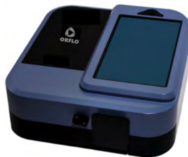
Figure 1 – a.) Orflo's Moxi GO II – Next Generation Flow Cytometer. 488nm Laser, 2 PMT (PMT 1 = 525/45nm, PMT 2 = 561nm/LP or 650nm/LP (swappable filter)). configuration Image shows user loading a sample into the two-test disposable flow cell. b.) 532nm laser (single 580/37nm filtered PMT) configured Moxi GO 532.